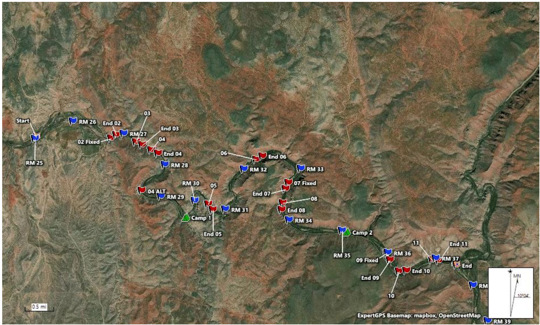
Figure 1. Map of electrofishing sites for the Perkinsville to Sycamore Creek section of the upper Verde River surveyed July 13-15, 2023.